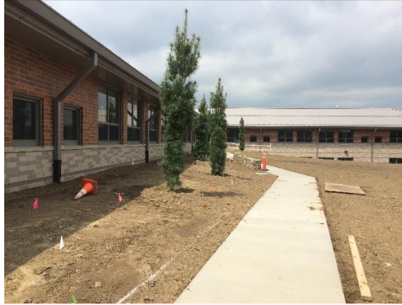
Landscape Installation Outside 3,4,5 Wing