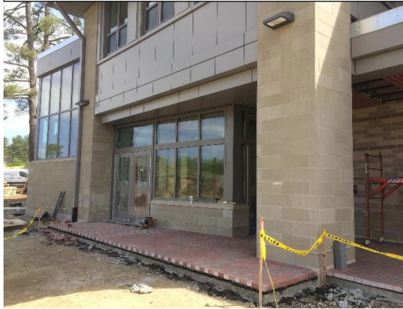
Pre-K, K Wing Entrance