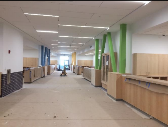
Pre-K, K Wing