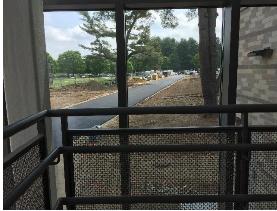
Installing The Temporary Roadway