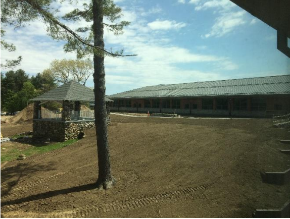
Gazebo and 3,4,5 Wing