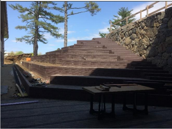
Outside Classroom Pre-K, K Wing