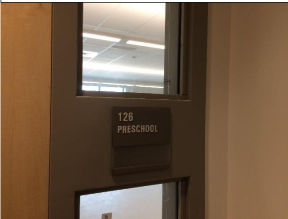
Finished Pre-School Classroom