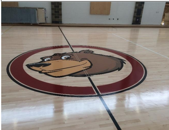
Gym Floor Logo