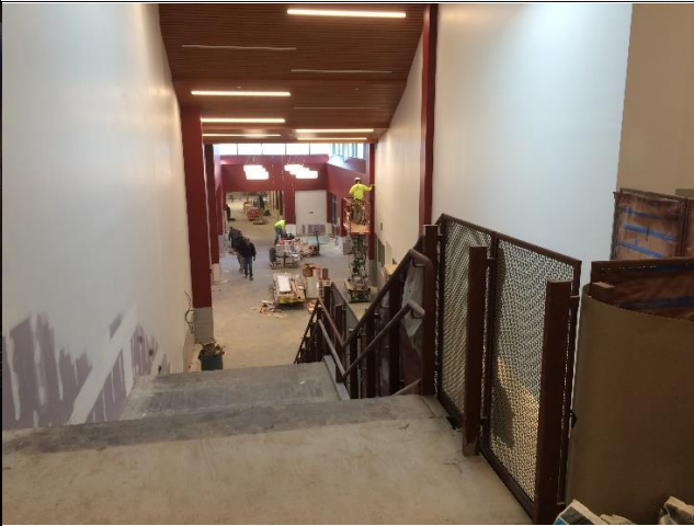
Main Entrance Corridor