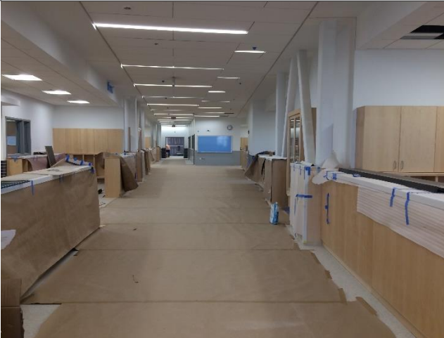
1 st Floor C Wing Common Area - Another View