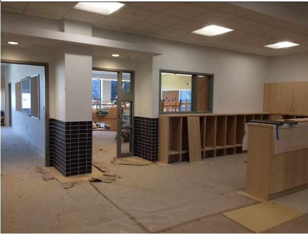
1 st Floor C Wing Common Area