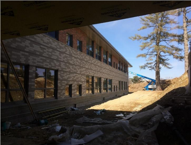
C Wing Exterior